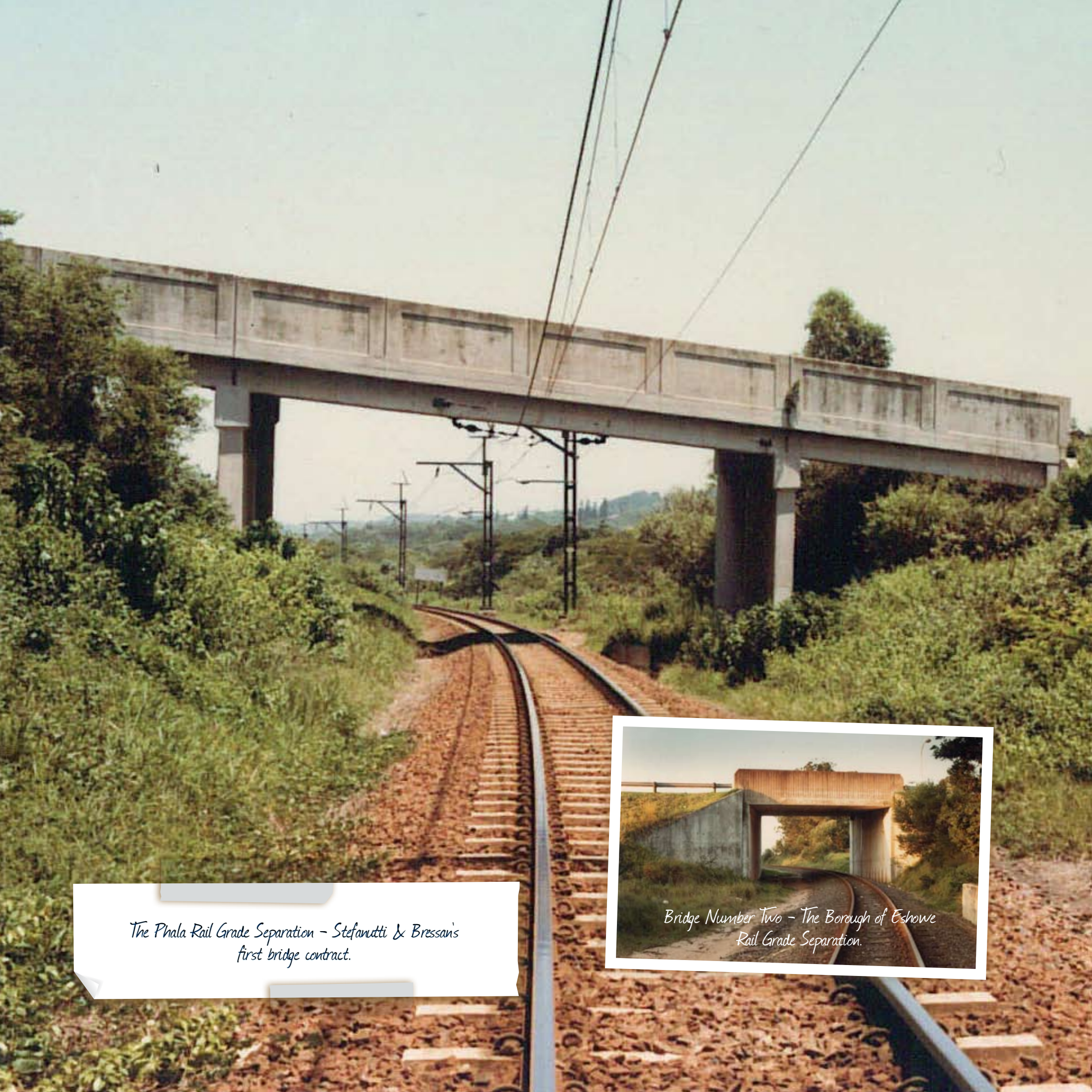
The Phala Rail Grade Separation - Stefanutti & Bressani's first bridge contract.